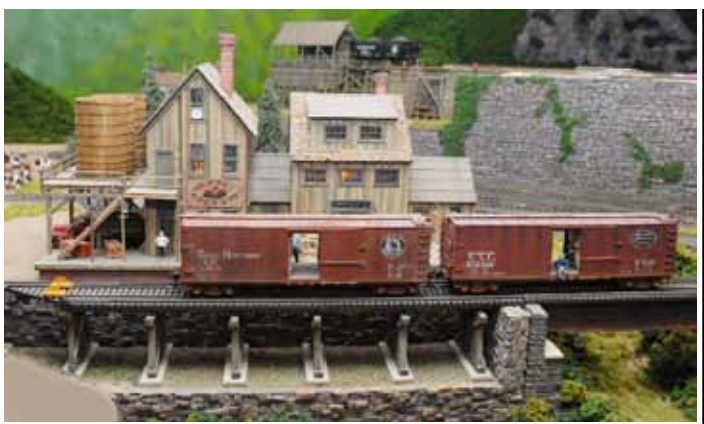
Without a doubt, this well known Division layout will find itself featured during the 2014 National Convention! How about yours?

Read the Flatwheel online at www.div4.org